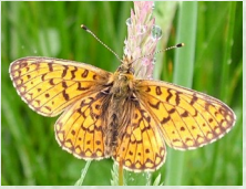
Small Pearl-bordered Fritillary