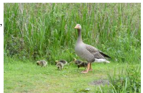
5 Goslings guarded by Mum

Blackbird, Blackcap, Blue Tit, Bullfinch, Buzzard, Carrion Crow, Chaffinch, Chiffchaff, Coal Tit, Collared Dove, Curlew, Dunnock, 'Farm Duck', Garden Warbler, Goldfinch, Great Spotted Woodpecker, Great Tit, Greenfinch, Grey Heron, Greylag Goose, House Sparrow, Jackdaw, Jay, Kingfisher, Little Grebe, Magpie, Mallard, Mistle Thrush, Moorhen, Nuthatch, Pheasant, Raven, Red Kite, Redpoll, Reed Bunting, Robin, Sedge Warbler, Siskin, Song Thrush, Sparrowhawk, Stockdove, Treecreeper, Tree Sparrow, Swallow, Whitethroat, Willow Warbler, Woodpigeon, Wren