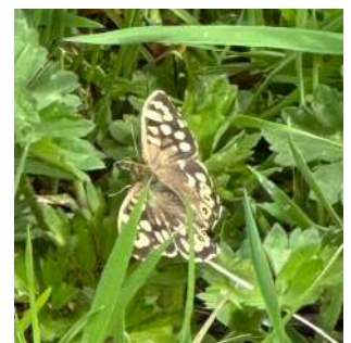
Speckled Wood (F)

Graham then took the group on a guided tour of the Reserve. The party learned about the range of trees planted on site, watched a colony of bees going in and out of a hole in an old tree, climbed on to a raised platform on a tree to watch the wildlife on a small pond below and then skirted a large pond to observe the flowers, wildfowl, butterflies and the hundreds of damselflies.