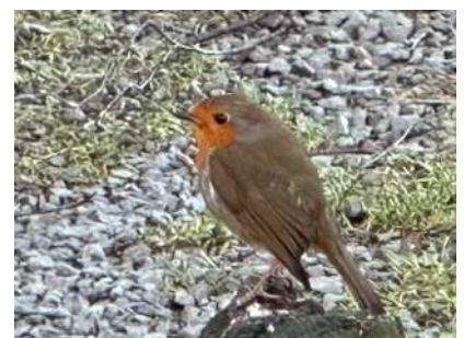
Row 1: Buzzard (SF), Great Spotted Woodpecker (JR), Kingfisher (SF) Row 2: Red Squirrel (SF), Great Spotted Woodpecker (JR), Red Squirrel (JR) Row 3 (JR): Winter Fungus, Oak Galls, Winter Fungus Row 4: Kingfisher (DB), Grey Heron (JR), Kingfisher (DB) Row 5 (JR): Red Squirrel, Grey Heron, Robin

Photographs by David Brantom (DB), Steve Fearon (SF), Jim Rae (JR)