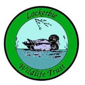
Scottish Charity No: SC 005538