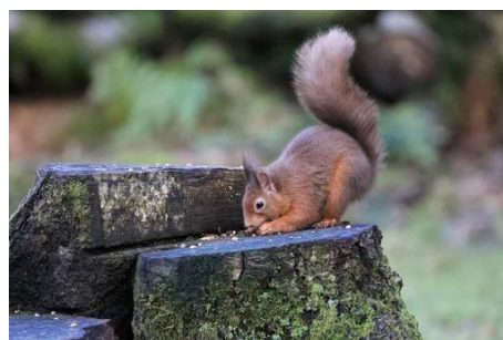
Row 1: Sulphur Tuft, Red Squirrel, Common Puffball Row 2: Treecreeper, Sammy and Sally, Female Blackbird Row 3: Red Squirrel, Frosted Fruits, Cock Pheasant Row 4 : Bank Voles territorial behaviour Row 5 : Coal Tit, Red Squirrel