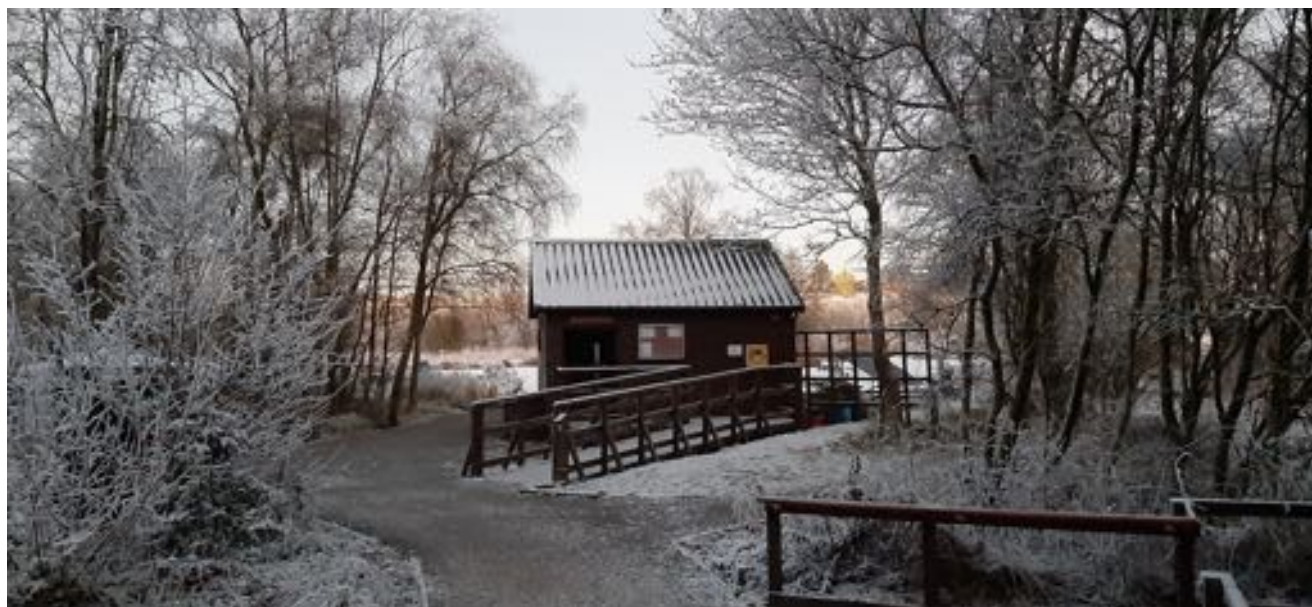
Eskrigg Centre 15.12.22