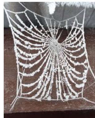
Frosted Spider's Web