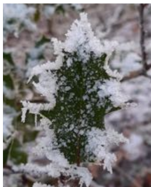
Frosted Holly Leaf