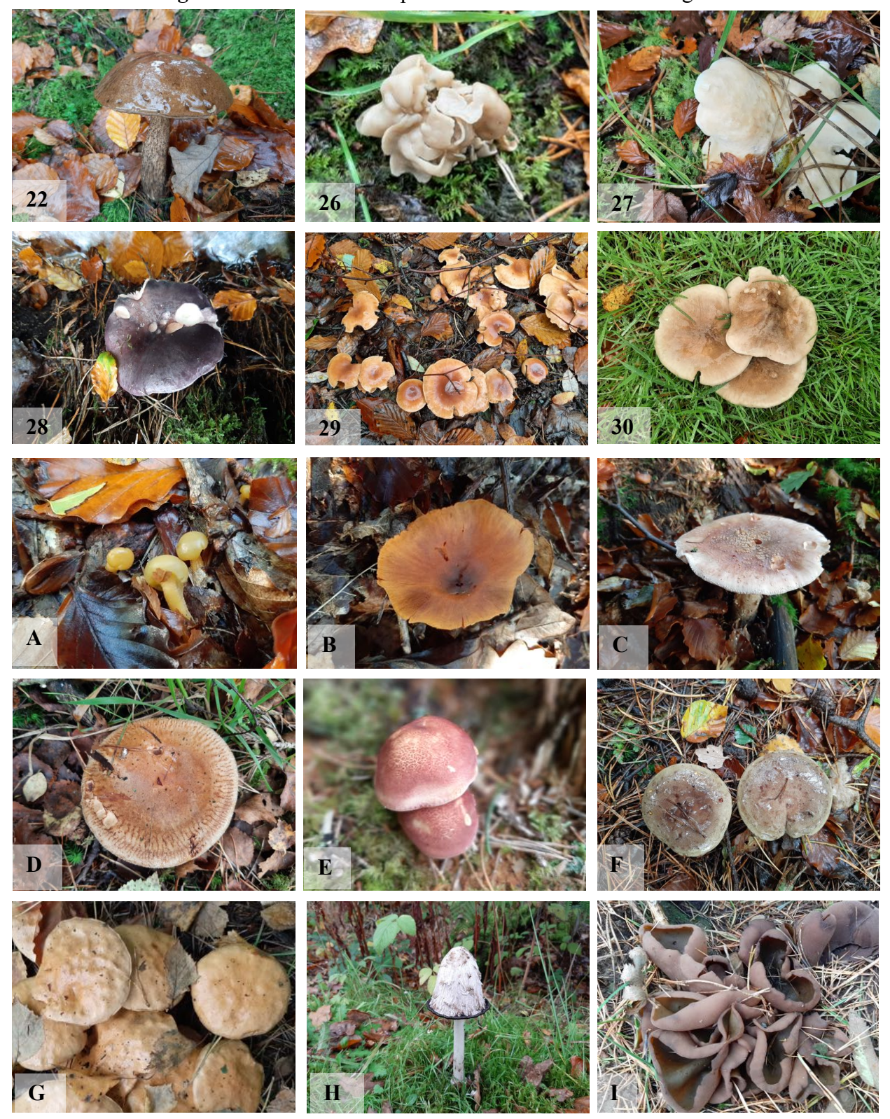
Row 1: Brown Birch Bolete (22), White Saddle (25), Wood Hedgehog (27) Row 2: Charcoal Burner (28), Tawny Funnel Cap (29), Clouded Funnel (30) Row 3: Jelly Baby (A), Bay Polypore (B), Blusher (C) Row 4: Brown Rollrim (D), Plums and Custard (E), Beech Milkcap (F) Row 5: Sticky Bolete (G), Shaggy Inkcap (H), Bay Cup (I).

3. October 2022 Photo-gallery – The numbered fungi were spotted on the Fungal Foray 30.10.22. The lettered fungi are a few of the ones spotted on other occasions during October.