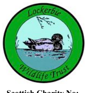
Scottish Charity No: SC 005538