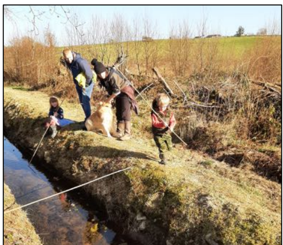
Participants that stayed for a photograph at the end.