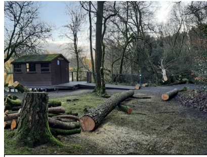
3 days later

One of the trees blown over landed on the roof of the Centre but appears to have caused little damage. Stuart managed to cut it down without causing any further damage. Well done.