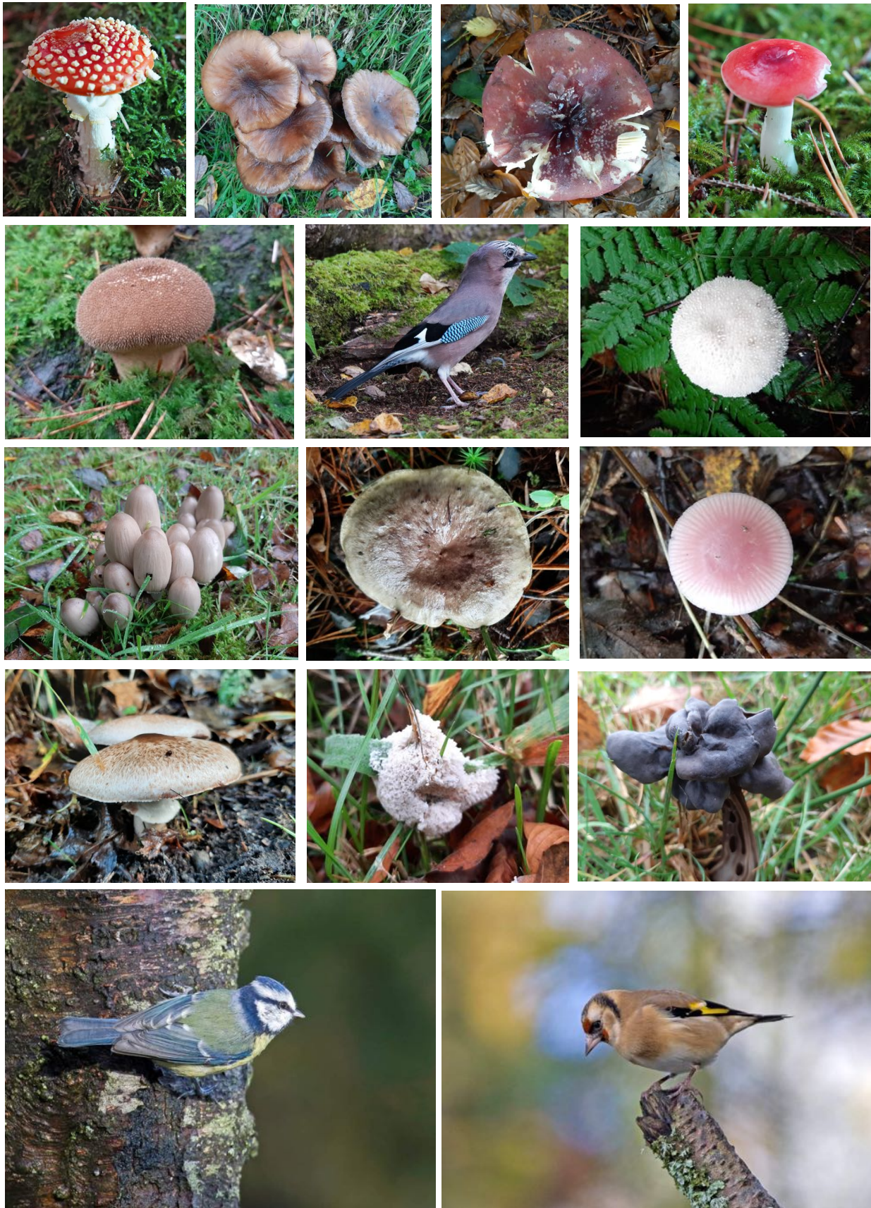
Row 1: Fly Agaric, Honey Fungus, Nutty Brittlegill, Sickener