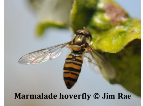
Marmalade hoverfly