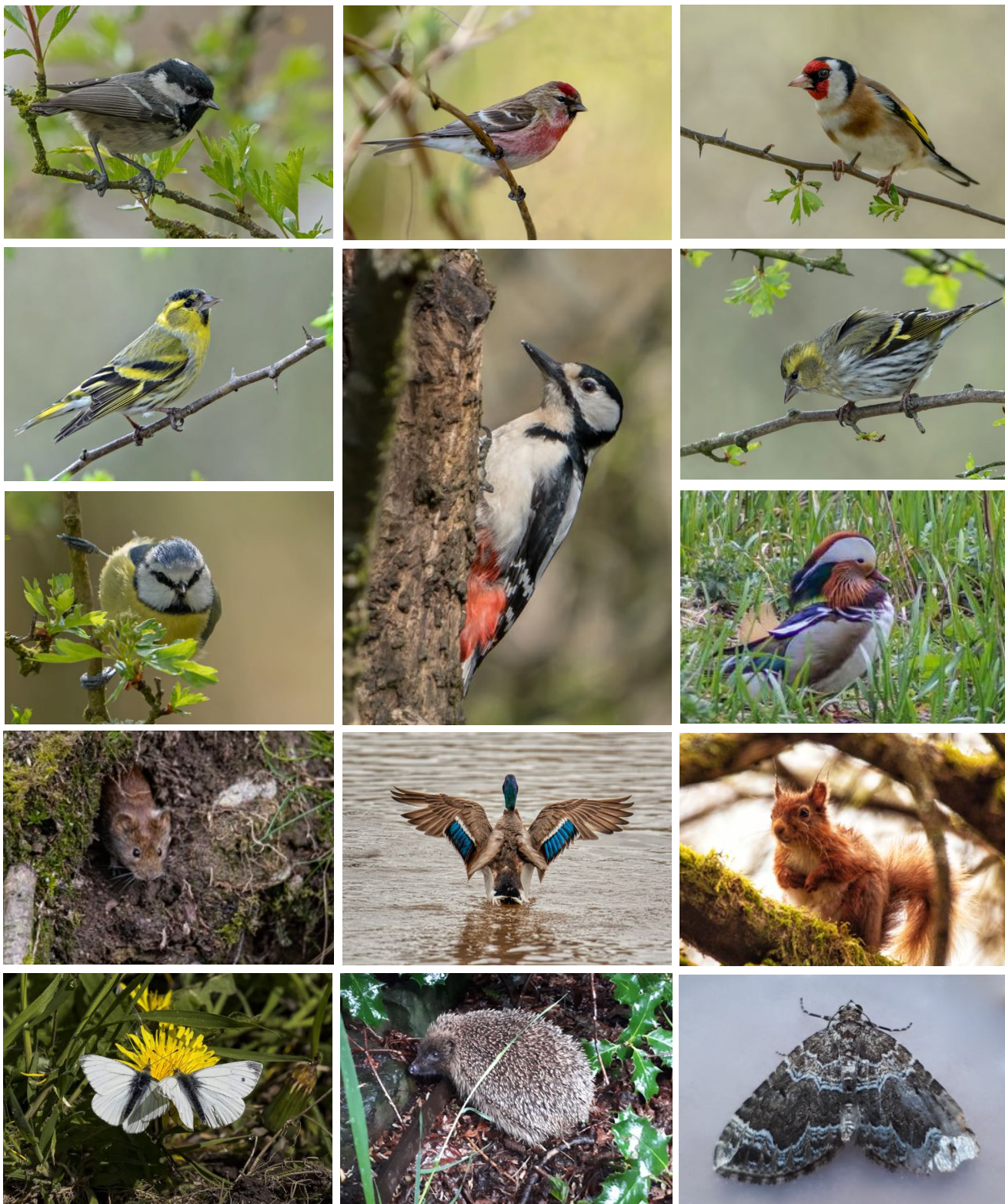
1st Row : Coal Tit, Lesser Redpoll, Goldfinch 2nd Row : Male Siskin, Great Spotted Woodpecker, Female Siskin 3rd Row : Blue Tit, GSW, Mandarin 4th Row : Bank Vole, Mallard, Red Squirrel 5th Row : Green-veined White, Hedgehog, Water Carpet