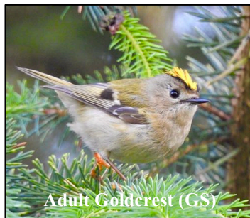
Adult Goldcrest (GS)

Blackbird, Blackcap, Blue Tit, Bullfinch, Buzzard, Carrion Crow, Chaffinch, Chiffchaff, Coal Tit, Common Gull, Cuckoo, Goldcrest, Goldfinch, Goshawk, Great Spotted Woodpecker, Great Tit, Greenfinch, Grey Heron, House Martin, House Sparrow, Jackdaw, Jay, Kestrel, Lesser Redpoll, Mallard, Moorhen, Mute Swan, Nuthatch, Oystercatcher, Pheasant, Pied Wagtail, Raven, Reed Bunting, Robin, Rook, Sedge Warbler, Siskin, Song Thrush, Sparrowhawk, Starling, Swallow, Tree Sparrow, Whitethroat, Willow Warbler, Wood Pigeon, Wren.