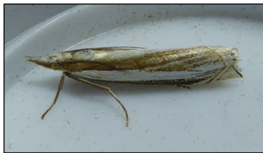
Micro-moth: Crambus pascuella