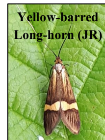
Yellow-barred Long-horn (JR)

Chimney Sweeper (M), Crambus pascuella (M), Large White, Meadow Brown, Nettle-tap (M), Orange-tip, Peacock, Red Admiral, Ringlet, Silver Y (M), Small Copper, Small Pearl-bordered Fritillary, Small Skipper, Small White, Udea olivalis (M), Yellow-barred Long-horn (M).