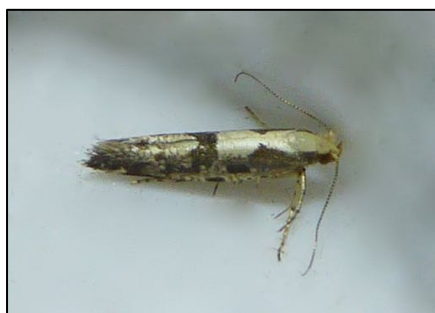
Micro-moth: Argyresthia conjugella (Apple Fruit Moth)

Hypericum humifusum - Trailing St. John's-wort