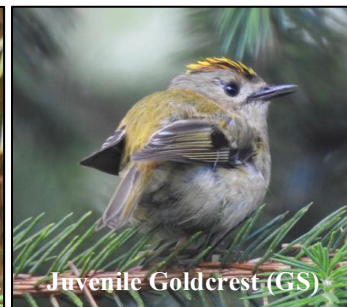
Juvenile Goldcrest (GS)