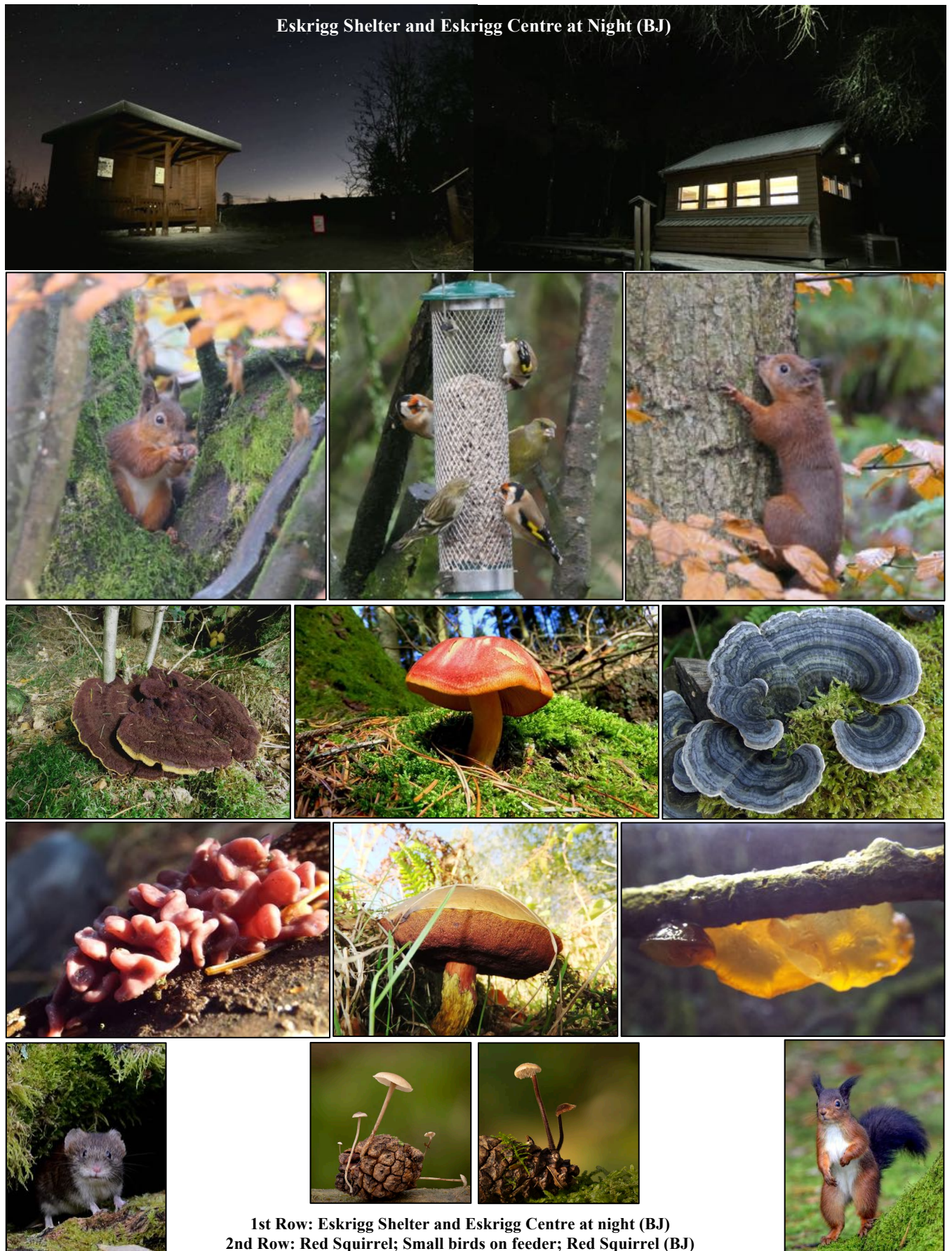
1st Row: Eskrigg Shelter and Eskrigg Centre at night (BJ) 2nd Row: Red Squirrel; Small birds on feeder; Red Squirrel (BJ)