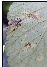
Phragmidium bulbosum on underside of bramble leaf