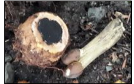
A Truffleclub with its underground truffle.