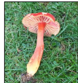
Honey Waxcap ( Hygrocybe reidii )