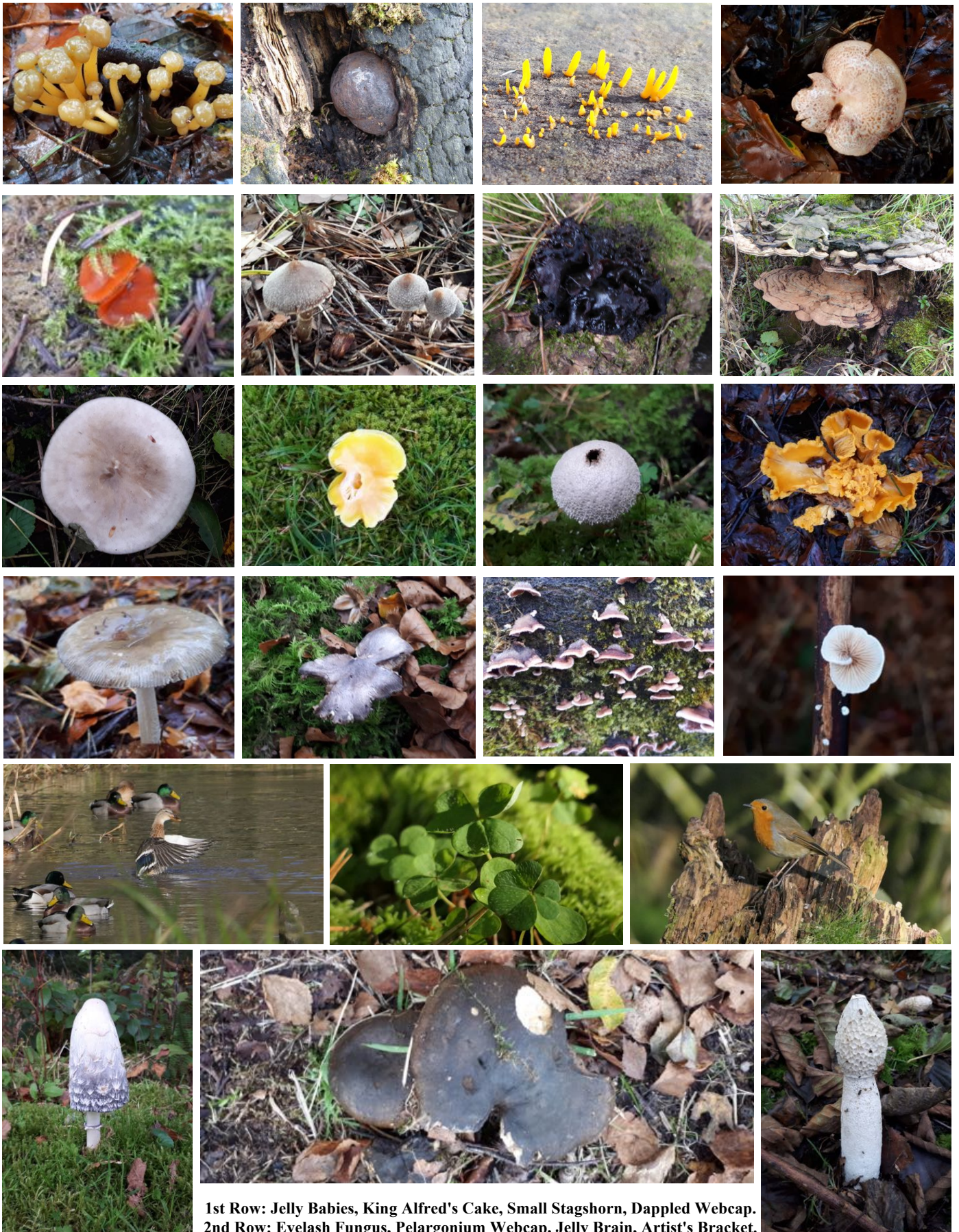
1st Row: Jelly Babies, King Alfred's Cake, Small Stagshorn, Dappled Webcap. 2nd Row: Eyelash Fungus, Pelargonium Webcap, Jelly Brain, Artist's Bracket. 3rd Row: Clouded Funnel, Golden Waxcap, Common Puffball, Chanterelle. 4th Row: Grisette, Fleck-gill Knight, Silverleaf fungus, Grass Oysterling. 5th Row: Mallard Ducks (BJ), Wood Sorrel (BJ), Robin (BJ). 6th Row: Shaggy Inkcap, Ugly Milkcap, Stinkhorn.