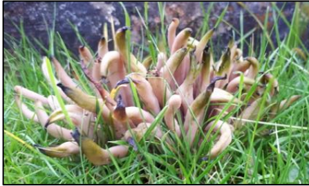
Smoky Spindles ( Clavaria fumosa )