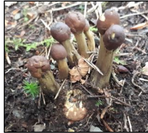
A Truffleclub ( Cordyceps longisegmentis )