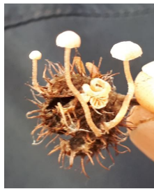
Hymenoscyphus fructigenus on beechmast