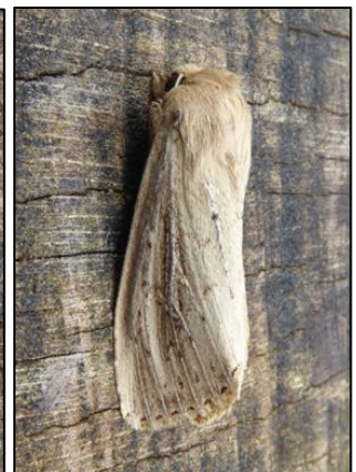
Large Wainscot Rhizedra lutosa