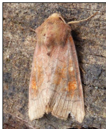
Large Ear Amphipoea lucens