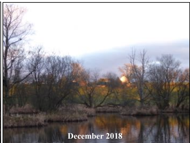
Pond area with Eskrigg Farm in the background

The pond was dug out by Jim Dalglish, Contractors, Moffat. The sum quoted for the digging of the pond was £1,100. On completion of the work the charges were waived by way of a donation to the project.