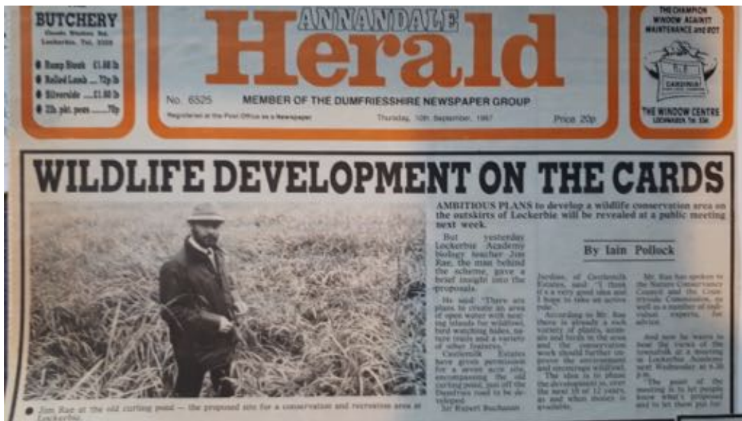
Public Meeting held in September 1987 to outline plans for the new reserve