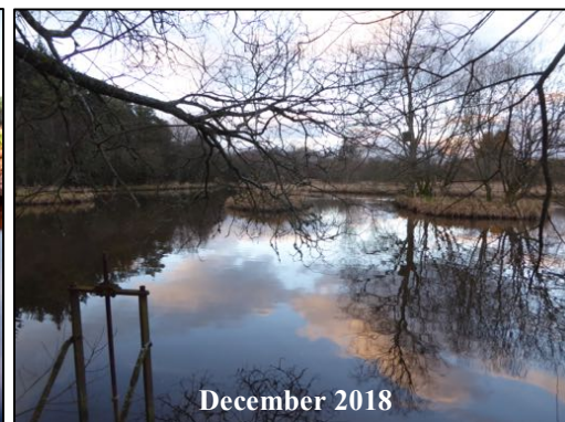
View of pond from the sluice