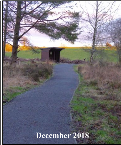
Shelter built on the foundations of the curling hut