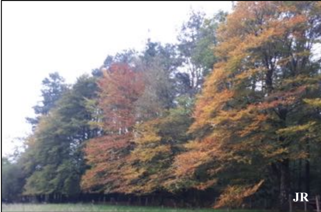
Woodland edge in range of autumn colours.