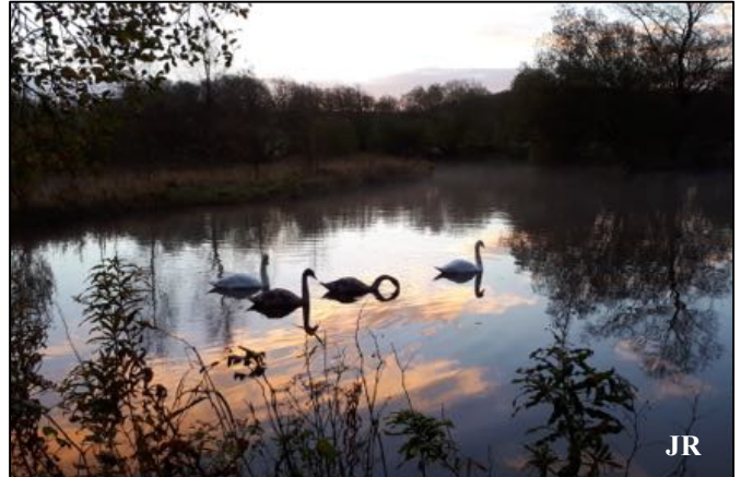
Swans on the pond at dawn.