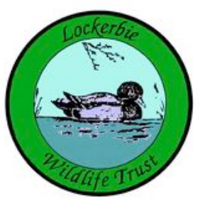
Scottish Charity No: SC 005538