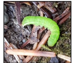
24 December 2017

The larval food includes a diverse range of herbaceous plants, shrubs and deciduous trees including Chickweed ( Stellaria media ), Broad-leaved Dock ( Rumex obtusifolius ), Dog's Mercury ( Mercurialis perennis ), Common Nettle ( Urtica dioica ), Bramble ( Rubus fruticosus ), Hazel ( Corylus avellana ), birches, oaks and willow.