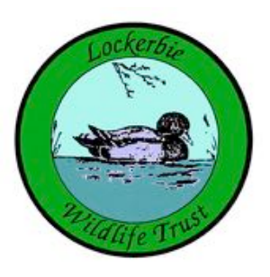
Scottish Charity No: SC 005538

1. Mute Swans on the pond at sunset - 30.11.17 - Young tree plantation in late afternoon.