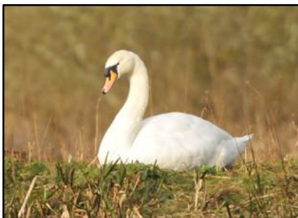
Basking in the sun in the middle of March.