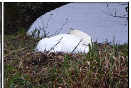
Keeping a low profile in heavy rain at the end of March.

Mute Swans sometimes graze on short grass, but mainly feed on aquatic plants and aquatic invertebrates such as insects and snails. They start to breed when they are 3 to 4 years old.