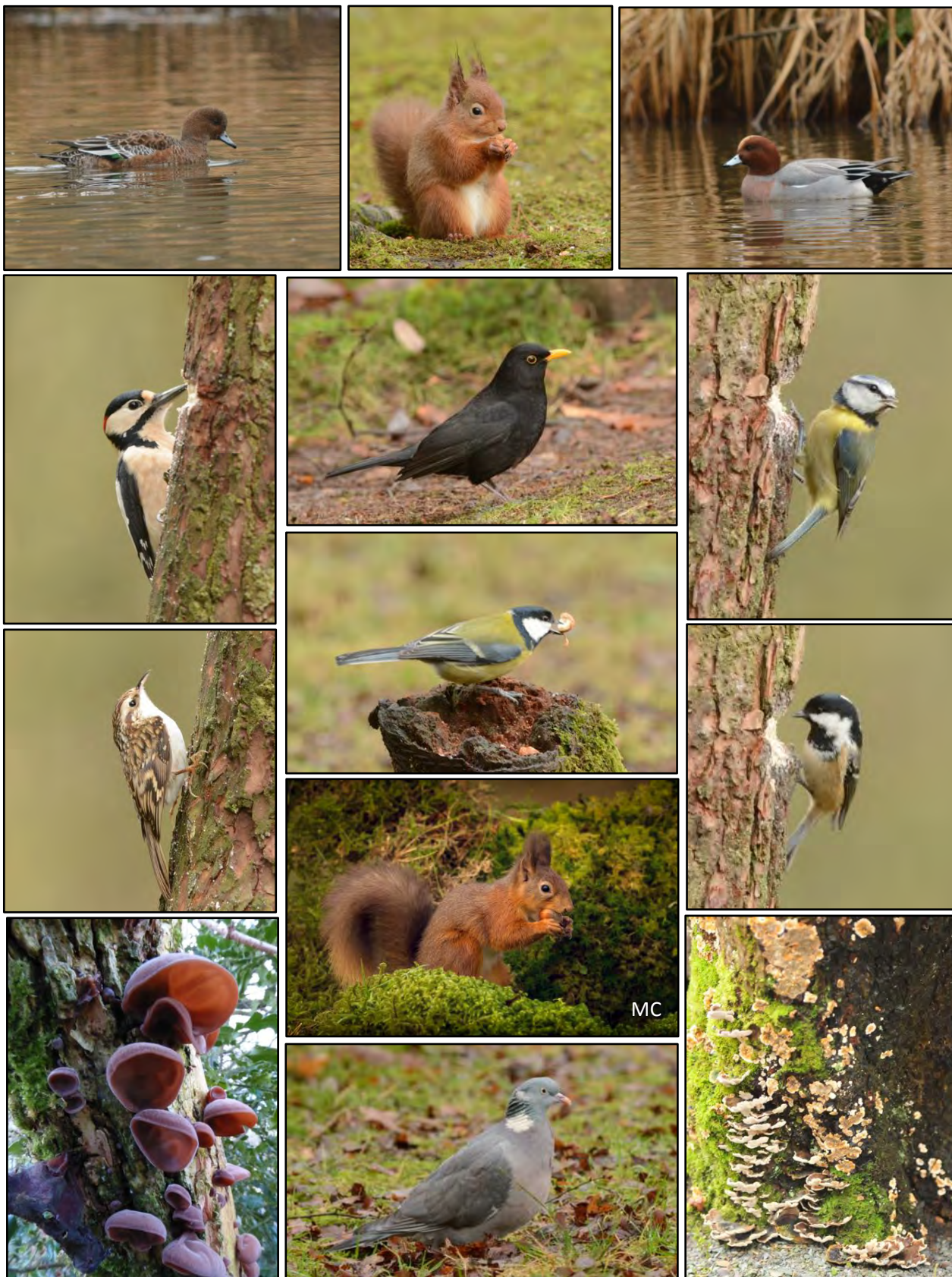
Row 1: Female Wigeon, Red Squirrel, Male Wigeon. Row 2: Great Spotted Woodpecker, Blackbird, Blue Tit. Row 3: Treecreeper, Great Tit ( above ), Red Squirrel ( below ), Coal Tit. Row 4: Jelly Ear, Woodpigeon, Assorted Fungi on Willow Stump.