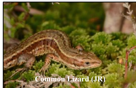
Common Lizard

Photographs: Jim Rae, Bob Little (BL).