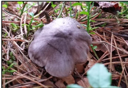
Grey Knight ( Tricholoma terreum )