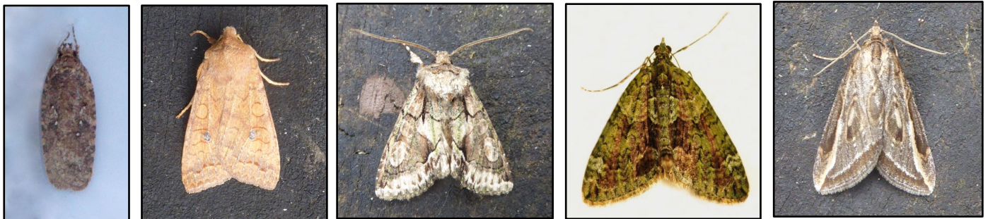
L to R: Agonopterix heracliiana , Brick, Green-brindled Crescent, Red-green Carpet, Streak.