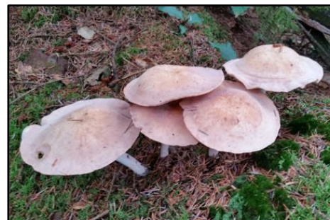
Spotted Toughshank ( Collybia maculata )