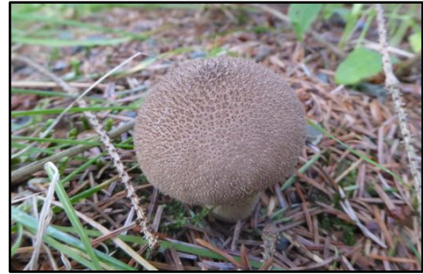
Brown Puffball ( Bovista nigrescens )