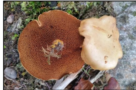
Peppery Bolete ( Chalciporus piperatus )