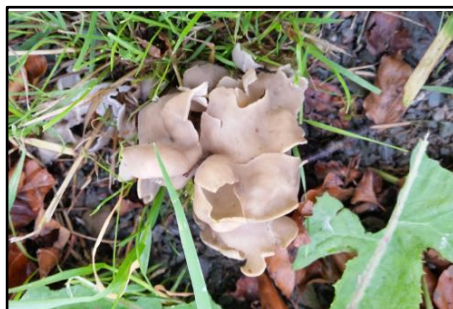
Elastic Saddle ( Helvella elastica )