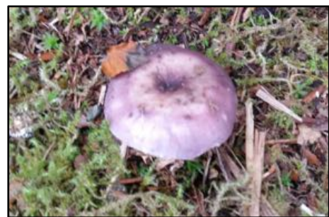
Fragile Brittlegill ( Russula fragilis )