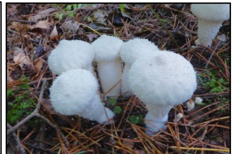
Common Puffball ( Lycoperdon perlatum )