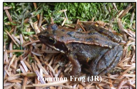
Common Frog (JR)