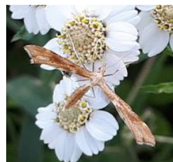
Yarrow Plume ( Gillmeria pallidactyla )