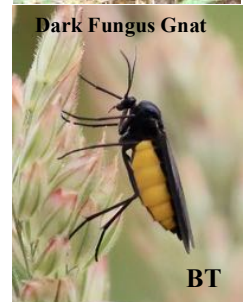
Dark Fungus Gnat