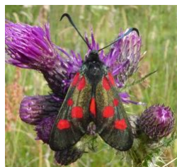
Narrow-bordered Five-spot Burnet ( Zygaena ioniceae ssp. latomarginata )