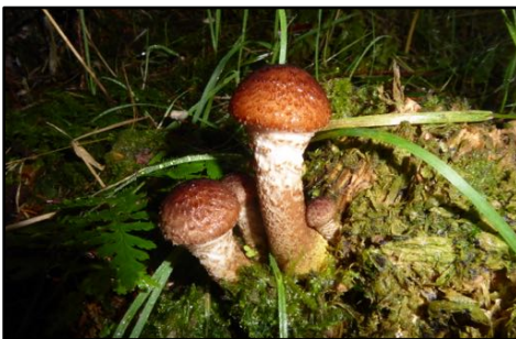
Dark Honey Fungus