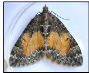
Common Marbled Carpet