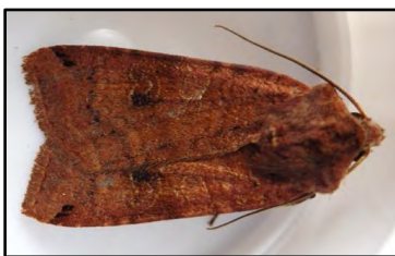
Large Yellow Underwing