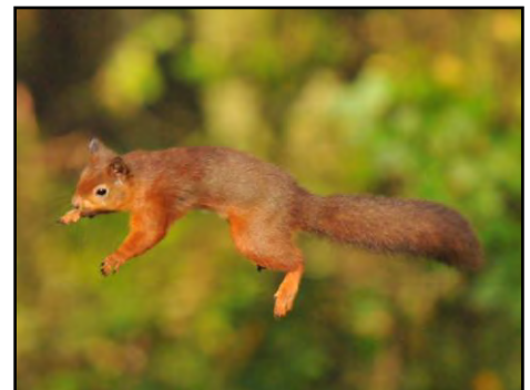
Red Squirrel (20.10.15) JR

Black Slugs; butterflies - Red Admiral and Small Tortoiseshell; Dragonflies - Black Darter, Common Darter and Southern Hawker; spiders.