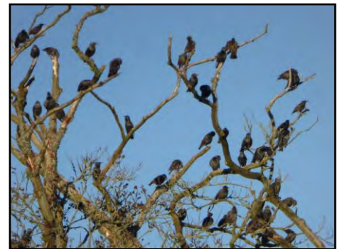
Flock of Starlings (1.10.15) JR

Blackbird, Blue Tit, Bullfinch, Buzzard, Carrion Crow, Chaffinch, Coal Tit, Common Sandpiper, Dunnock, Fieldfare, Goldcrest, Goldfinch, Great Spotted Woodpecker, Great Tit, Greenfinch, Grey Wagtail, House Sparrow, Jackdaw, Jay, Kestrel, Kingfisher, Little Grebe, Long-tailed Tit, Mallard, Moorhen, Mute Swan, Nuthatch, Pheasant, Raven, Robin, Rook, Sedge Warbler, Siskin, Song Thrush, Sparrowhawk, Starling, Swallow, Tawny Owl, Treecreeper, Tree Sparrow, Willow Warbler, Woodcock, Woodpigeon, Wren.