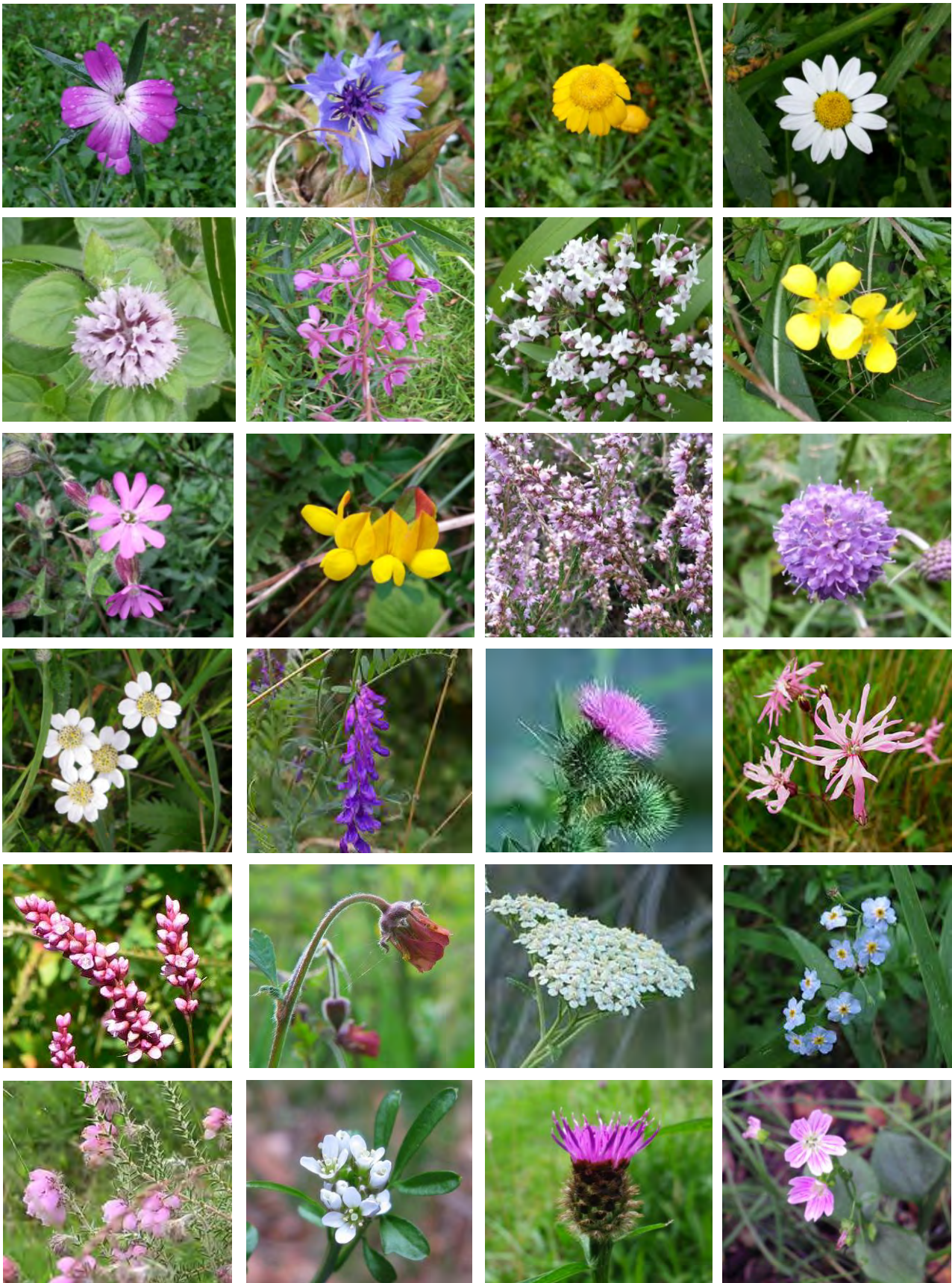
Row 1: Corncockle, Cornflower, Corn Marigold, Corn Chamomile. Row 2: Water Mint, Rosebay Willowherb, Marsh Valerian, Tormentil. Row 3: Red Campion, Bird's-foot Trefoil, Ling Heather, Devil's-bit Scabious. Row 4: Sneezewort, Tufted Vetch, Spear Thistle, Ragged Robin. Row 5: Redshank, Water Avens, Yarrow, Water Forget-me-not. Row 6: Cross-leaved Heath, Hairy Bittercress, Knapweed, Pink Purslane.