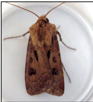
Heart & Dart